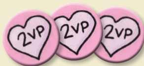
Victory Point Tokens (VP)