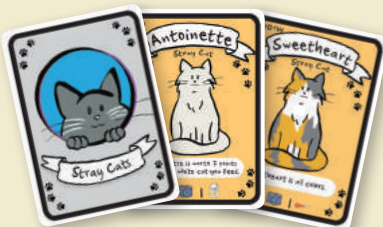
Stray Cat Cards